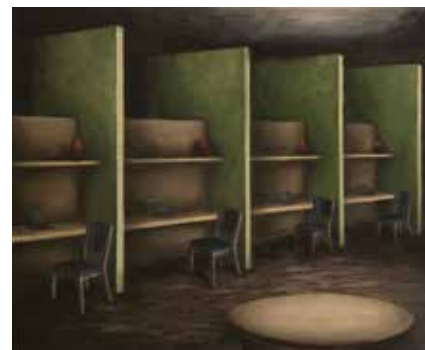
Karien Balluff, Full Employment #3, oil on canvas, 18" x 24", 2012

Shoreline has three clubs in the fine arts: the photography club, the art club, and the clay club. In this show, the clubs display samples of the best printmaking, painting, drawing, photography, sculpture, and ceramics from students involved in club activities throughout the year.