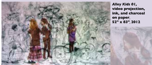
Alley Kids 01, video projection, ink, and charcoal on paper, 52" x 83", 2012

Scott Kolbo creates digitally manipulated animations that are projected over static wall drawings. He mixes video footage of characters with intentionally clunky animation techniques and then allows the moving images to interact with site-specific temporary drawings. The resulting documentation is a record of both the performance as well as the drawing. Kolbo uses recurring characters and environments that allow him to investigate some of the social, political, and ethical issues that confront private individuals and communities in contemporary society.