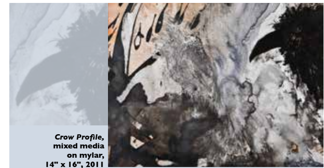
Crow Profile, mixed media on mylar, 14" x 16", 2011

Matt Allison's work borrows aspects of the long human tradition of functional ceramic vessels while exploring one Westerner's interpretation of the modern Japanese aesthetic. Vertical orientation and premeditated openings of functional ceramics blend with asymmetrical balance, elegance, and the natural with visual evidence of the process. The surfaces often employ clay's natural tendencies to stretch and crack while the forms are a product of studied and controlled composition. Matt Allison is a new addition to the Shoreline Visual Art faculty.