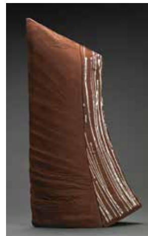
Vertical Rock Form, hand-built stoneware, 20", 2012