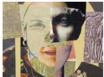
Beth Halfacre, Cancer in My Pocket, mixed media collage, 9" x 12"