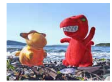
Trash Dance, gouache on paper, 8" x 11

Beach-found detritus — PETE water bottles, plastic toy animals, and consumer product packages — are the subject and medium of Karen Hackenberg's current artwork. Painting in oil and gouache, she meticulously crafts images of commercial beach flotsam. In the Watershed paintings, the artist presents humorous ironic images of our new post-consumer creatures of the sea. Castaways from grocery shelf life, synthetic products proudly and cheerily proclaim their natural rights as they strand and break apart on inter-tidal coasts. As gyres of garbage swirl in the Pacific, plastic becomes the new sand.