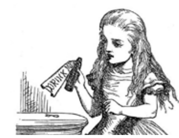
Sir John Tenniel, from Alice's Adventures in Wonderland , wood engraving

20 artists respond to the provocative title, Drink Me . Using the medium of clay, the artists will demonstrate the wide range of use and imagination involved in the ceramic vessel. This exhibition will include work from faculty, students and invited professional artists, and will run during the annual NCECA (national council for education in the ceramic arts) convention. The national convention is being held in Seattle with the theme of On the Edge.