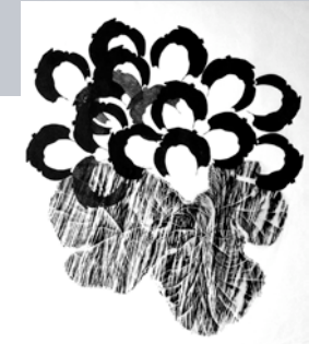
"Geisha Surround the Hawthorn Stump", relief print, 2013.