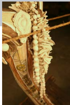
"Load" (detail of Rocking Horse), carved Porcelain and found mixed media, 2012. 15" x 22" x 5"