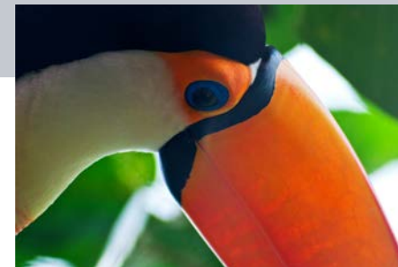
Nathan Dziejwiontkoski, "Toucan", 12" x 18" digital print, 2013.