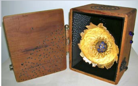
Jules Remidios Faye, "The Infant Sun Within" mixed media, 2012.