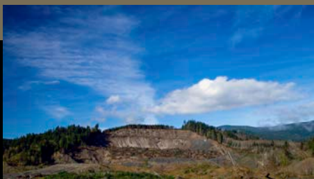
Phil Eidenberg-Noppe, A River Bend with Side Part 1-5 , 2014