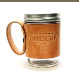
One Cup Coffee Company, Mug