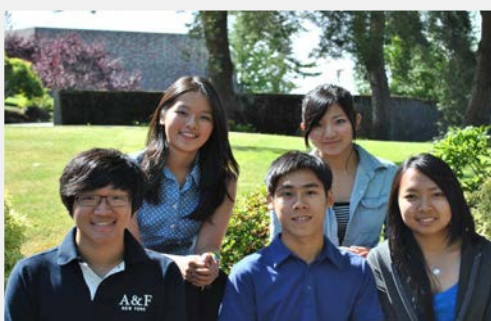
International Peer Mentors