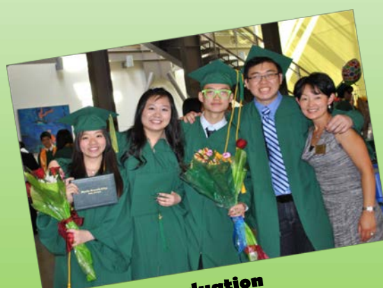
Shoreline Graduation Commencement