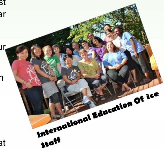
International Education Of Ice Staff