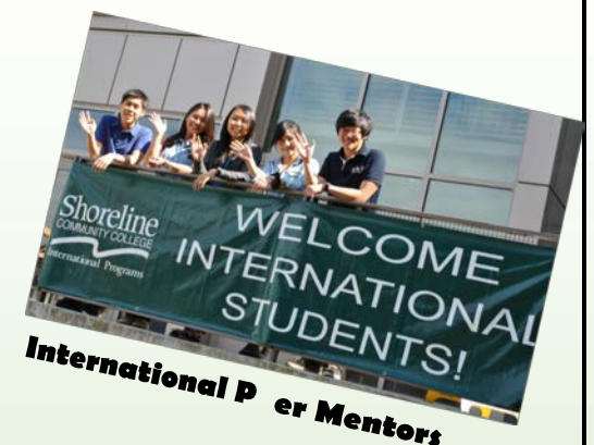
International Peer Mentors