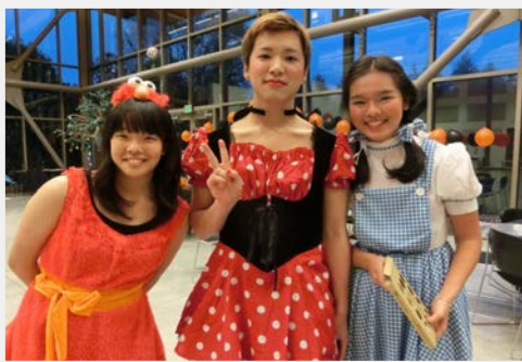
We are in Halloween Costumes!

We believe the best learning not only happens in the classroom but also outside the classroom. We have over 50 student clubs on the campus. We strongly encourage our international students to participate in student organizations and community services. One of the main goals of attending various student activities is to help students get to know themselves, meet with new people and learn about American culture. Engaging in classes and activities helps students gain new skills and knowledge, get to know themselves better, meet new people, and learn about American culture.