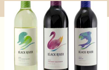
Cherie Tsui Black River Wine Packaging , 2015

Four SCC visual arts clubs come together in this exhibition to display artwork created by students involved in club activities throughout the year. Photography Club, Art Club, VCT Club, and Clay Club members present their best work in ceramics, printmaking, photography, digital imagery, design, painting, drawing, and sculpture. These clubs are open to new members from the entire campus community.