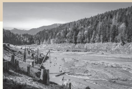
Lauren Greathouse, The Free Elwha , 2012

Shoreline faculty, Lauren Greathouse and Claire Putney, present an exhibition of photographs and mix-media drawings that focus on the history, evolution, and recovery of the Elwha River, located on the Olympic Peninsula. This series of images and drawings is not merely about a free river, but part of a larger investigation of the human desire to domesticate the landscape and control natural resources in ways that benefit human existence with a disregard to the effects.