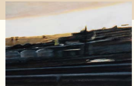
Molly Magai, The Sun Sets on Industry (detail), 2014

Working from snapshots taken from a moving vehicle, Molly Magai creates paintings of landscapes dominated by cities, roads, industry, and the living things that inhabit them. These structures, created for human convenience, are very much in conflict with nature. They are also an awe-inspiring human accomplishment, the work of generations of builders and engineers. Magai's intention as a genre painter is to make you see them, in their destructiveness and their beauty.