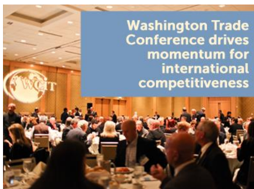
Washington Council on International Trade (WCIT) Annual Conference on Trade, Seattle November 18, 2013

"[W]e talk about big businesses. . . but free trade could also affect small local business in a way where if imported goods were to be increased, that would mean more competition for local business that produced similar goods."