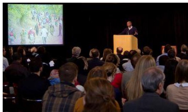
Global Washington (Global WA) Annual Conference on Development, Seattle November 13, 2013