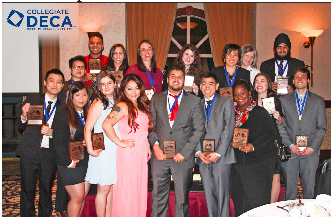
Shoreline Community College