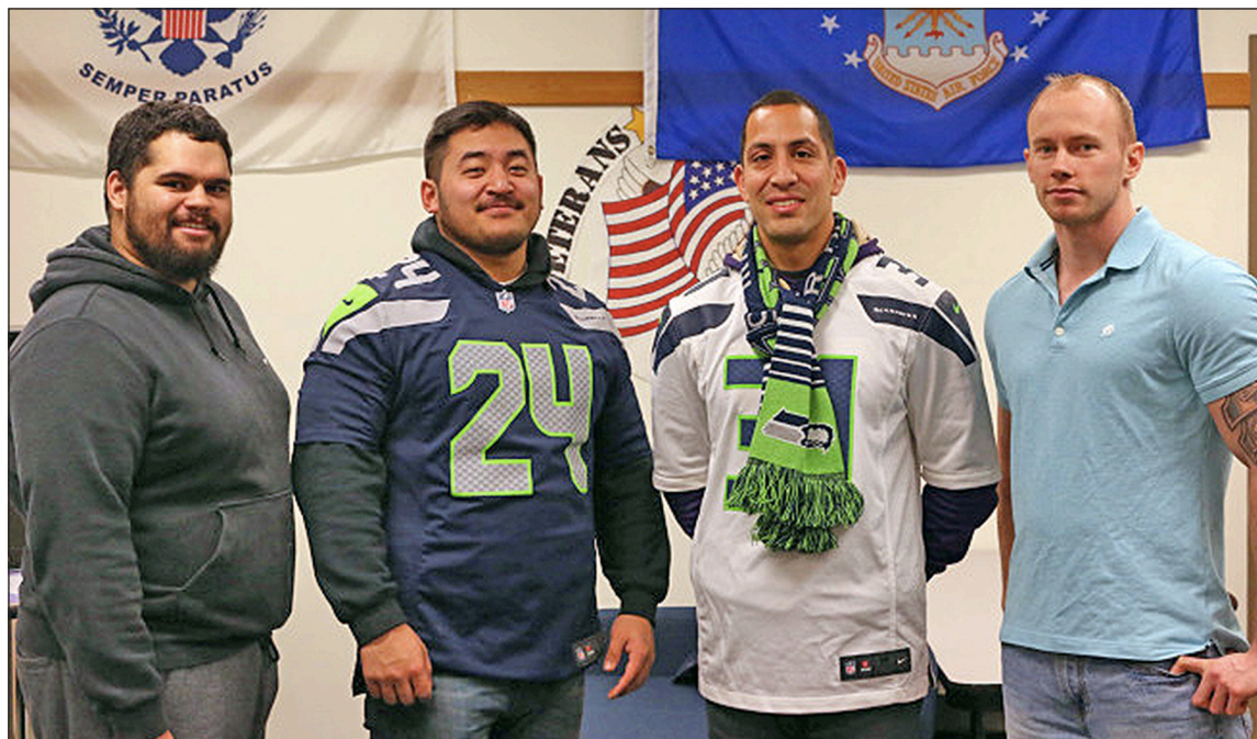
Shoreline Community College

Training to become a Hospital Corpsman began at the Naval Hospital Corps School in Great Lakes, Ill., and continued with field emergency medicine at Camp Pendleton, Calif. That's where he was