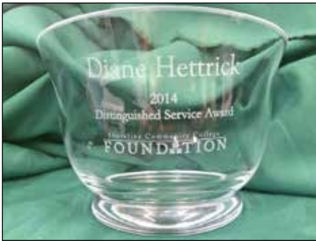
Shoreline Community College