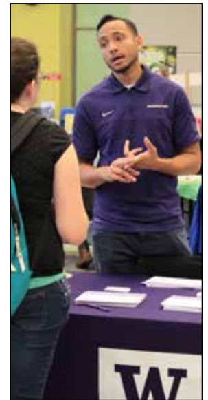
Shoreline Community College