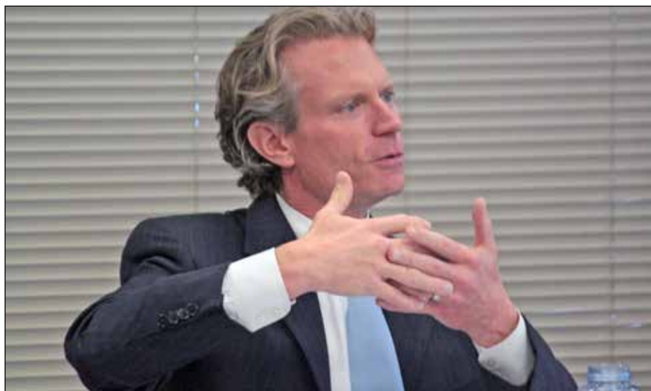
Shoreline Community College

A number of other organizations are supporting the project, including the Aspen Institute and Achieving the Dream at the national level and the Workforce Development Council of 4 Seattle-King County at the local level.