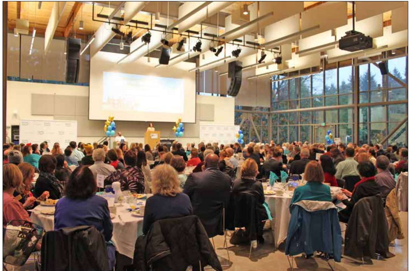
Shoreline Community College