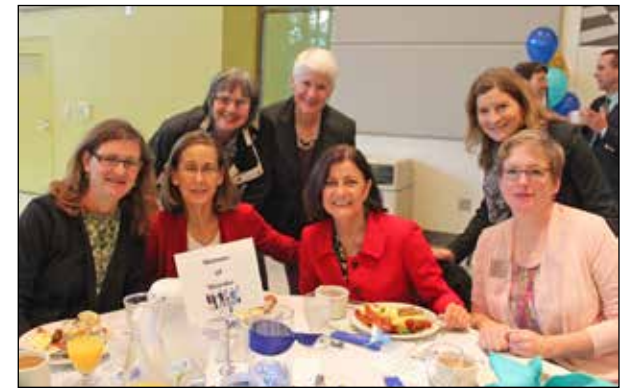
Shoreline Community College