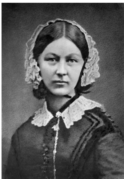
Florence Nightingale (1820—1910)

Known as the “Lady with the Lamp”, she was a British nurse, social reformer and statistician and best known as the founder of modern nursing.